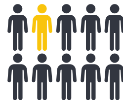
1 IN 10 SENIORS GO ONLINE ALMOST CONSTANTLY