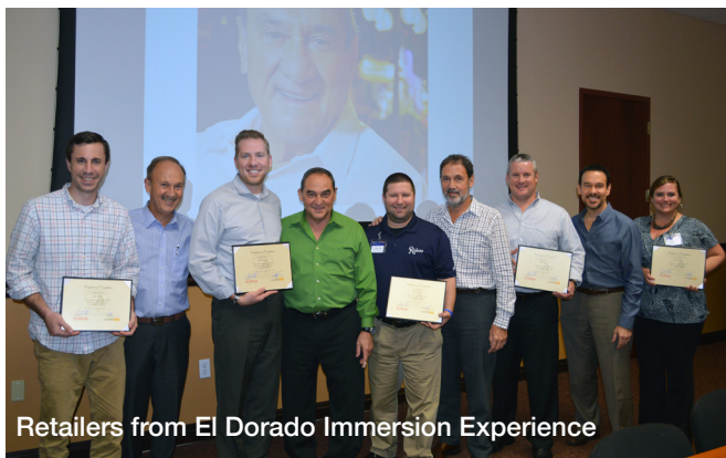
Retailers from El Dorado Immersion Experience