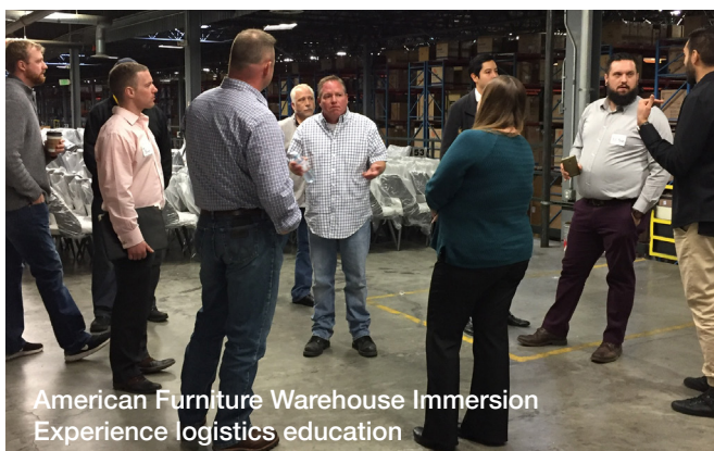
American Furniture Warehouse Immersion Experience logistics education